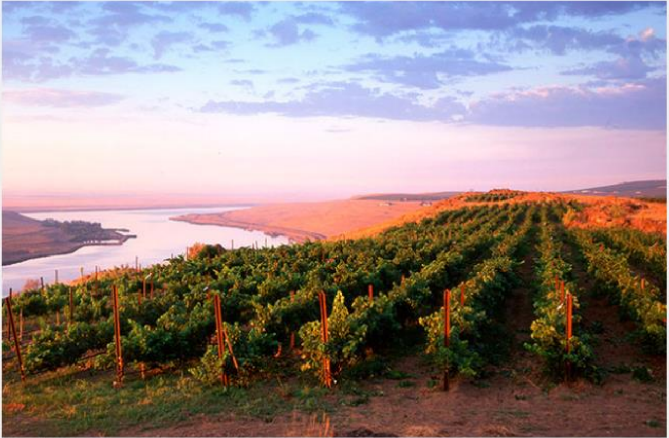
Alexandria Nicole Cellars